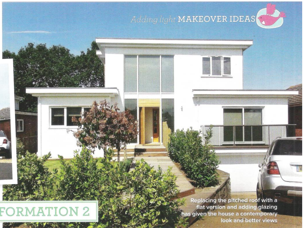
Replacing the pitched roof with a flat version and adding glazing has given the house a contemporary look and better views