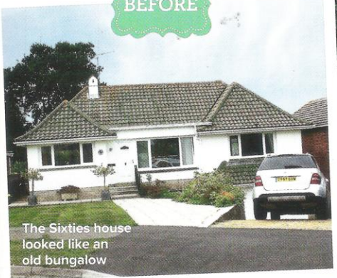
The Sixties house looked like an old bungalow