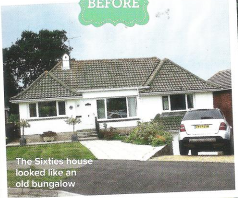
The Sixties house looked like an old bungalow